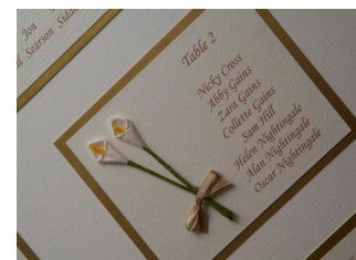
Table Plan Serves an important purpose, but is also a remarkable feature at your reception. They are made to co-ordinate with your invitations and colour scheme. Available framed or unframed and are a lovely keepsake from your wedding day.

Thank-you Cards These are the same size and style as your invitation with either a blank insert for you to hand write or a choice of pre-printed messages.